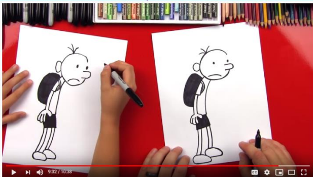
How To Draw Greg From Diary Of A Wimpy Kid

I would love to see your work. Below are two I liked.