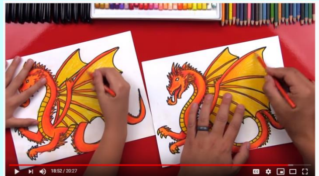
How To Draw A Dragon

Art for Kids Hub. How To Draw Greg From Diary Of A Wimpy Kid.